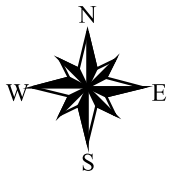
Figure 3: Operations Map, Fitzgerald Woodlot